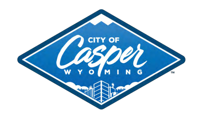
Table of Contents Friday, May 31, 2019