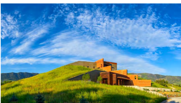
The Brinton Museum, home to this year's Welcome Reception

Please make plans to join us, and a few hundred of your municipal peers, at the 2019 WAM Summer Convention, June 12-14, 2019 in Sheridan. We think we've prepared a great event for you, filled with fantastic training opportunities, interesting cultural experiences, and