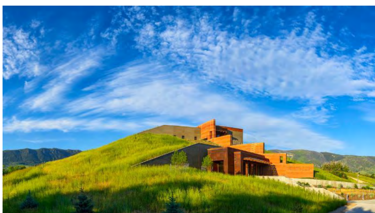
The Brinton Museum, home to this year's Welcome Reception

Please make plans to join us, and a few hundred of your municipal peers, at the 2019 WAM Summer Convention, June 12-14, 2019 in Sheridan. We think we've prepared a great event for you, filled with fantastic training opportunities, interesting cultural experiences, and