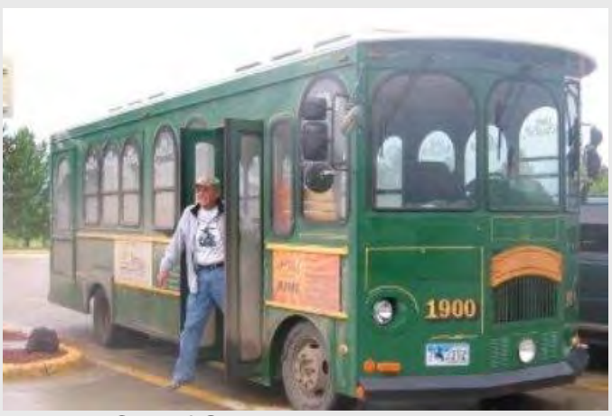
City of Sheridan Trolley Buses

There will be two separate trolley tours available during WAM Summer Convention next month in Sheridan. Both tours will leave directly from the convention venue and will take riders to locations that serve as